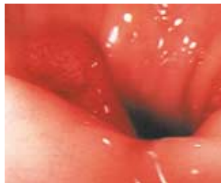
Figure 2 A further pseudopolypoid lesion in the transverse colon. Multiple pseudopolypoid lesions were present throughout the left and transverse hemicolon. Complete loss of the normal vascular architecture is noted additionally, in keeping with quiescent ulcerative colitis.