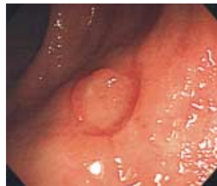
Figure 4 Follow-up colonoscopy (at 2 weeks) showed an ulcer scarring. No further bleeding has occurred during 6 months of follow-up.