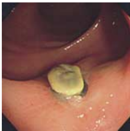
Figure 3 Endoscopy at 1 week after the procedure revealed a 10 mm wide shallow ulcer at the site of the lesion. The O-ring remained on the ulcerated lesion.