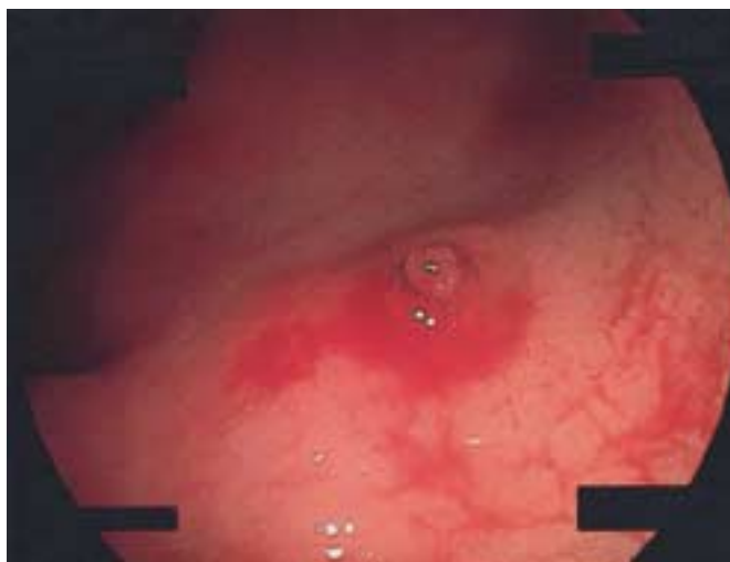
Figure 1 An 85-year-old Japanese woman with rectal Dieulafoy's lesion presented with fresh blood hematochezia. Colonoscopy revealed a 5 mm shallow mucosal defect with an exposed vessel in the anterior wall of the lower rectum.