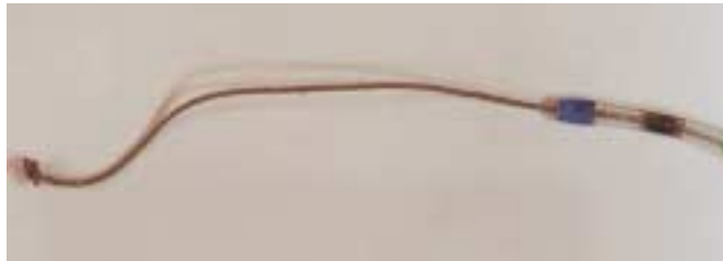
Figure 2 The knotting was probably caused by reuse of a disposable guide-wire