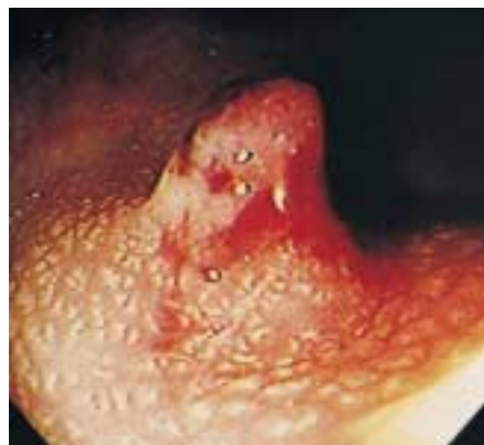
Figure 1 Colonoscopic view of the bleeding rectal lesion after basal injection of 1 ml of 1:10 000 epinephrine

3 Dept. of Pathology, University of British Columbia, Vancouver, Canada