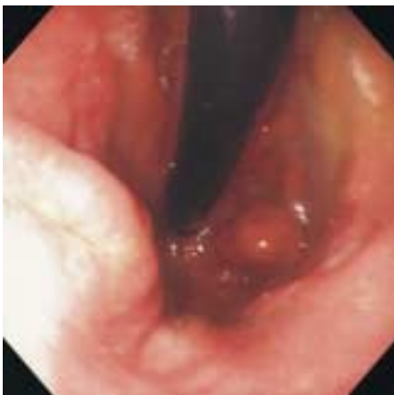
Figure 1 Endoscopic finding of two submucosal tumors in the remnant stomach