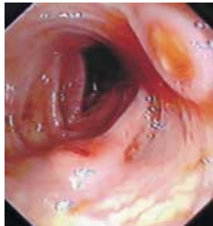
Figure 1 Multiple maculopapular lesions observed along the colonic mucosa

2 Kidney Transplant Unit, Dept. of Surgery, Policlinico Universitario Catania, Italy