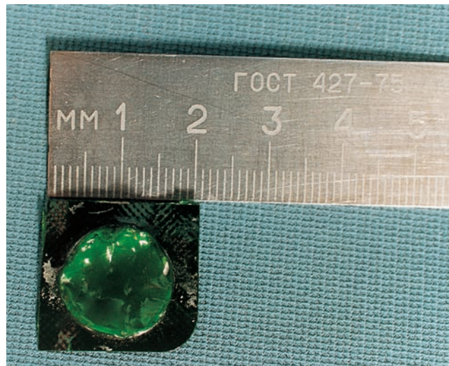
Figure 2 The size of the plastic-covered pill, 2 cm in diameter.