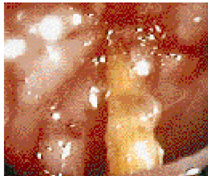
Figure 1 The endoscopic appearance of the toothpick in the sigmoid colon

Dept. of Internal Medicine, Central Hospital of German Armed Forces Koblenz, Medical Division, Johannes-Gutenberg University, Mainz, Germany