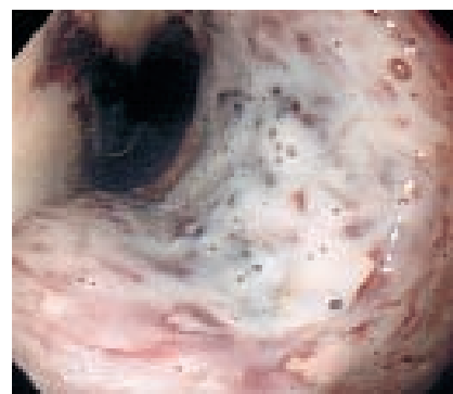
Figure 1 The patient experienced bleeding after endoscopic mucosal resection. a The resected area shows oozing blood. b Three bleeding points were detected after Maalox was poured on (strawberry-milk sign was positive).

c Hemostasis was achieved by the use of thermocoagulation. d No bleeding points were detected after Maalox was poured on (strawberry-milk sign was negative)