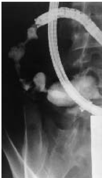
Figure 1 Multiple jejunal stenosis in oral push enteroscopy

In the upper digestive tract repeated dilations are successful in CD in continuing to prevent the need for surgery if the dilation reaches up to 2 cm in order to prevent recurrence [2]. The use of combined radiology [3] is important for the evaluation of morphological aspects before and after dilation. The edema or fibrous component of the stricture is the main factor to explain recurrences and in some cases two or more sessions are needed. The dilation procedure with TPE in small-bowel stenosis is quick, relatively simple, and within reach of most endoscopists; moreover, its toler-