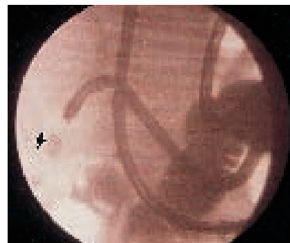
Figure 3 Balloon dilation in the jejunum (arrow)

ance is acceptable. The possibility of associated malignancy is also evaluated. To our knowledge, this is the first report which describes the usefulness of TPE in the dilation of jejunal CD.