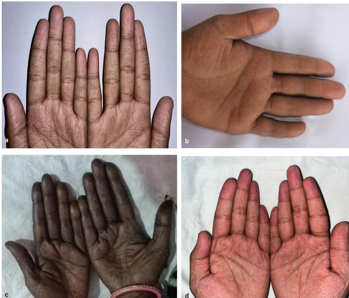
Fig. 1 Image displaying the loss of fingerprints (adermatoglyphia) after chemotherapy in (a) case 01, (b) case 02, (c) case 03, and (d) case 04.

A 27-year-old man presented with complaints of abdominal pain and obstruction in November 2022. On evaluation, he was diagnosed with adenocarcinoma of the right colon and underwent laparotomy with right hemicolectomy. The post-op histopathology was suggestive of adenocarcinoma of the right colon (pT3N1M0). He was planned for adjuvant chemotherapy (FOLFOX regimen). Nevertheless, after completion of five cycles, his PMJAY card registration failed because his fingerprints were not recognized by the biometric system (→ Fig. 1b). The remaining cycles were completed with NGO support.