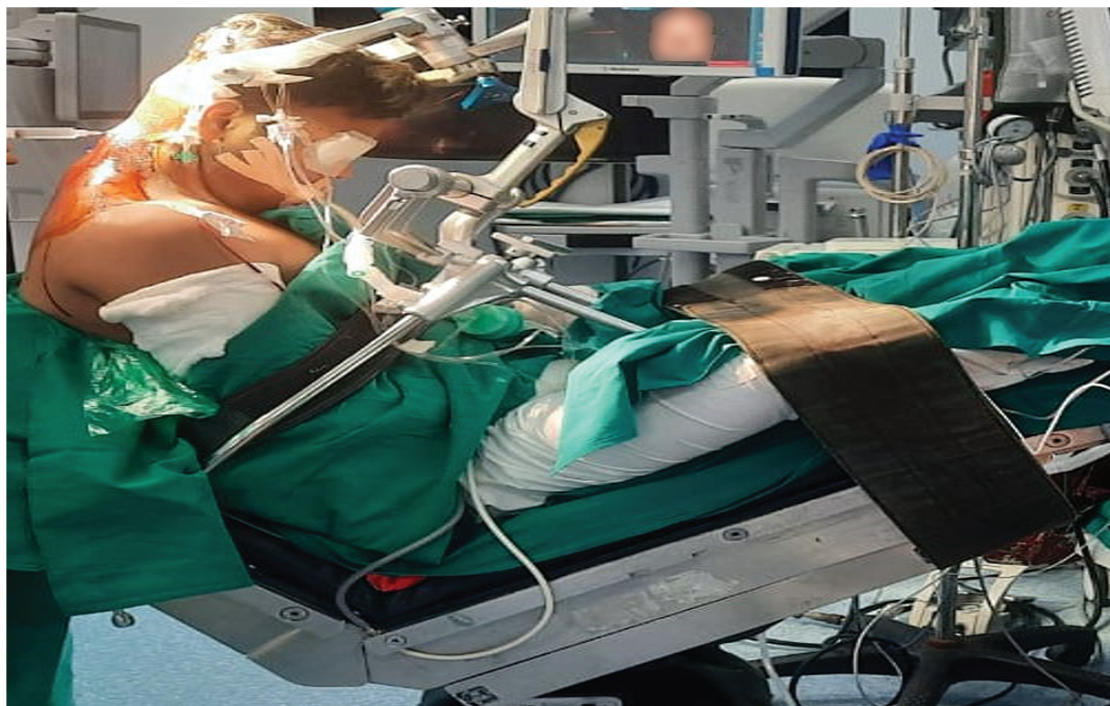
Fig. 1 Patient in the sitting position.

The median suboccipital supracerebellar approach to dorsal midbrain lesions requires patient to be in prone or sitting position. Sitting position gives potential advantages of good surgical field, access to airway and better ventilation. However, anatomical and physiological challenges, increased risk of VAE, hypotension, and tension pneumocephalus can be challenging and devastating. Functional integrity of descending motor pathways and their selective and specific assessment during critical surgical maneuvers is accomplished by MEP during brainstem surgeries especially those involving