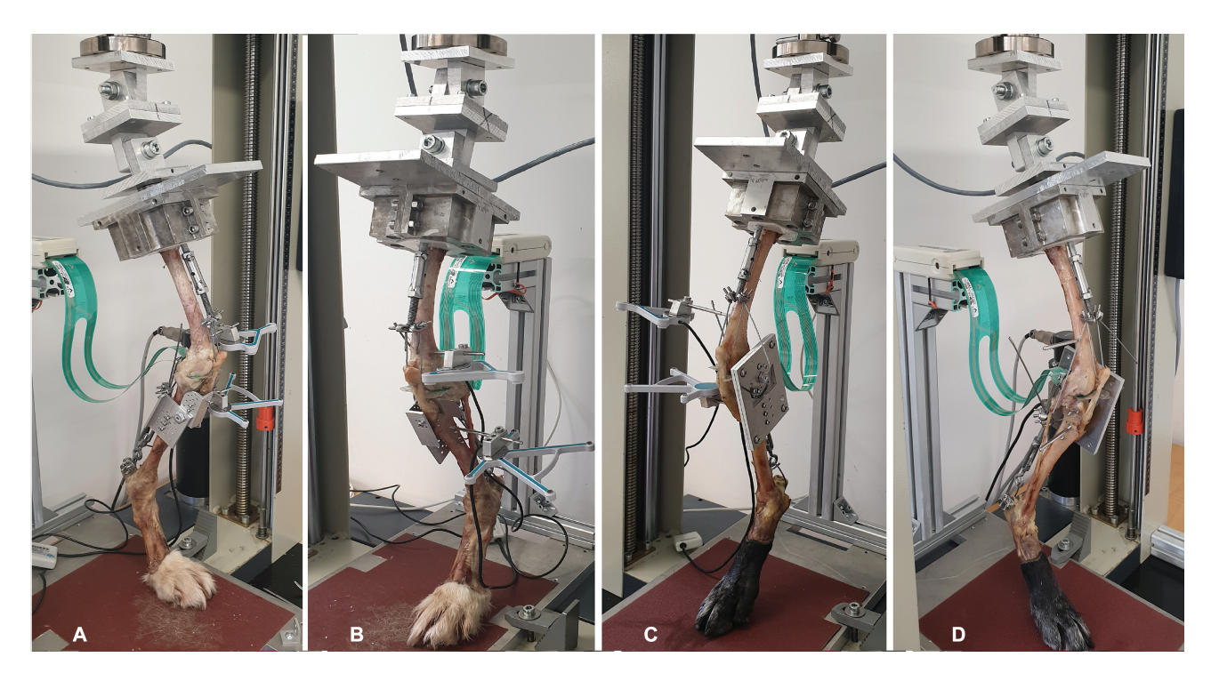
Fig. 2 Limbs ready for testing, with motion and pressure sensors in place (A: medial view with MMP-hinge plate in place, B: lateral view; C: medial view with TPLO-hinge plate in place, D: lateral view).

stifle, a new sensor was used and calibrated according to the producer's guidelines.