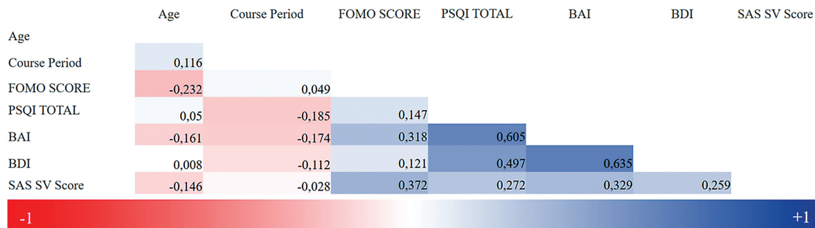
Fig. 1 Pearson Correlation Matrix - Color Map. BAI, Beck Anxiety Index; BDI, Beck Depression Index; FOMO, fear of missing out; PSQI, Pittsburgh Sleep Quality Index; SAS SV, Smartphone Addiction Scale Short Version.

associated with the inherent social demands and desires of this age group, FOMO becomes a distracting factor and is detrimental to performance in university students (another source of associated anxiety). In our study, there was a positive correlation between FOMO, poor sleep quality, and higher complaints related to anxiety.