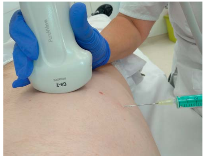
► Fig. 2 A safety distance between the ultrasound probe and the sterile needle is maintained in this freehand biopsy. If the examiner can ensure that the needle will not come into contact with the ultrasound probe, a sterile ultrasound probe cover is not necessary.

after every use is sufficient here. Disinfectants with only bactericidal and yeasticidal (yeast killing) activity are to be used.