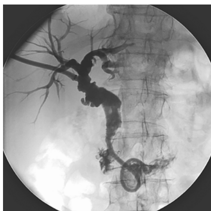
► Fig. 4 Radiographic image after electrohydraulic lithotripsy showing that the biliary stones have been completely removed.

and suction. Complete stone removal was achieved in all patients (► Fig. 4 ). An exemplary case is shown in ► Video 1 . None of the patients required percutaneous papillotomy or balloon dilation.