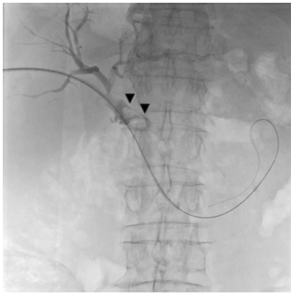
► Fig. 1 Percutaneous transhepatic cholangiography (PTC) showing large stones (▼) in the main bile duct.

We report a clinical case series of five patients with choledocholithiasis and anatomic abnormalities that made biliary access by endoscopic retrograde cholangiography (ERCP) impossible. In three patients, we were unsuccessful in accessing the biliary tract by single-balloon enteroscopy because of surgically altered anatomy with biliodigestive anastomosis. In two patients, a large diverticulum prevented intubation of the common bile duct. All of the patients presented with signs of cholestasis including elevated bilirubin levels. Magnetic resonance imaging (MRI) scans revealed one to three large stones in the main or intrahepatic bile duct. Different approaches for such patients have been described [1–3].