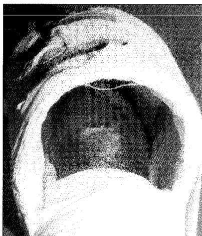
Figure 1: POP mold over the heel with the patient prone showing the flap and SSG over the pedicle

The method described to protect the pedicle of flaps to cover the posterior area in a heel defect is by no means simple as it is an invasive method, requires extra instrumentation and Ilizarov rings, which may not always be available in a plastic surgery unit. I have for long been using a simple plaster of Paris cast mould of about 16 to 20 layers roofed over an anterior cast. This not only effectively immobilises the limb and ankle, it also keeps off any pressure from the flap and the pedicle. (Figure 1 and 2)