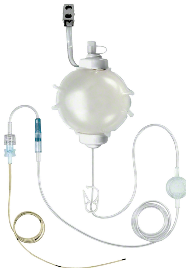
Fig. 1 Pain pump or pain buster, the cornerstone of pain management in PP group. PP, past protocol.

Data were retrieved retrospectively from the hospitals' electronic patient records, including age at surgery, weight, body mass index (BMI), comorbidities, previous medical history, intraoperative details, postoperative pain medication consumption, postoperative complications, side effects from opioid consumption and reoperations. Patient's previous medical history was examined with respect to comorbidities and history of a previous pain diagnosis was documented. Intraoperative details included type of flap used, whether unilateral or bilateral reconstruction, site of anastomosis, surgical method used for exposing recipient vessels (rib-sparing or rib-sacrificing) as well as method of