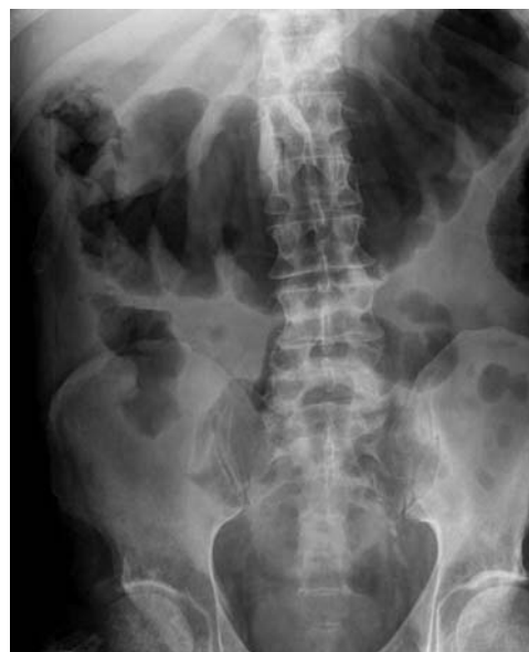
Fig. 1 Plain film of toxic megacolon demonstrating dilated transverse colon.

The mainstay of medical management of ASUC is intravenous (IV) corticosteroids. Recent guidelines from the American College of Gastroenterology recommend using methylprednisolone 60 mg/d or hydrocortisone 100 mg three to four times daily to induce remission. 12 In addition, patients with ASUC should receive IV hydration/resuscitation, electrolyte replacement as indicated, deep vein thrombosis (DVT) prophylaxis, blood transfusions as needed, and total parenteral nutrition if malnourished. Nonsteroidal anti-inflammatory medications, anticholinergic medications, antidiarrheal agents, and opiates should be avoided. The development of systemic toxicity, abdominal distension, peritonitis, frequency of bowel movements, and presence of melena or hematochezia should be assessed daily. Early surgical consultation should be obtained if the patient has any indica-