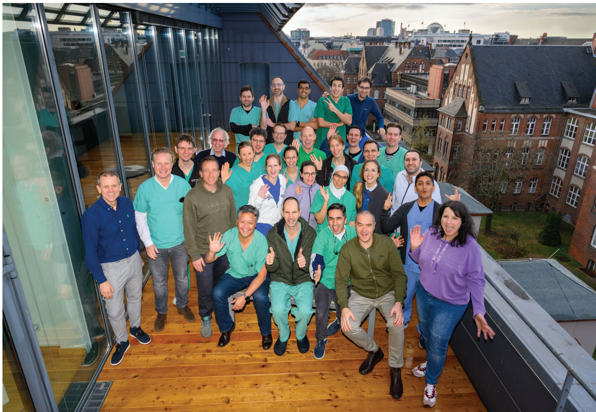
Fig. 1 Strong German Hearts 2023 at the Langenbeck-Virchow-House in Berlin, Germany.

36-hour shift as past generations used to, as an aim to finish the program. Alongside the motivated trainees, there were highly qualified and eager coaches, specialized trainers from the Federal Police, and supporters from the organizing team. The journey started the next morning at 7 a.m. Each candidate received a personal file including the detailed schedule and respective tasks for the psychological and concentration evaluations, which later would be analyzed by professionals.