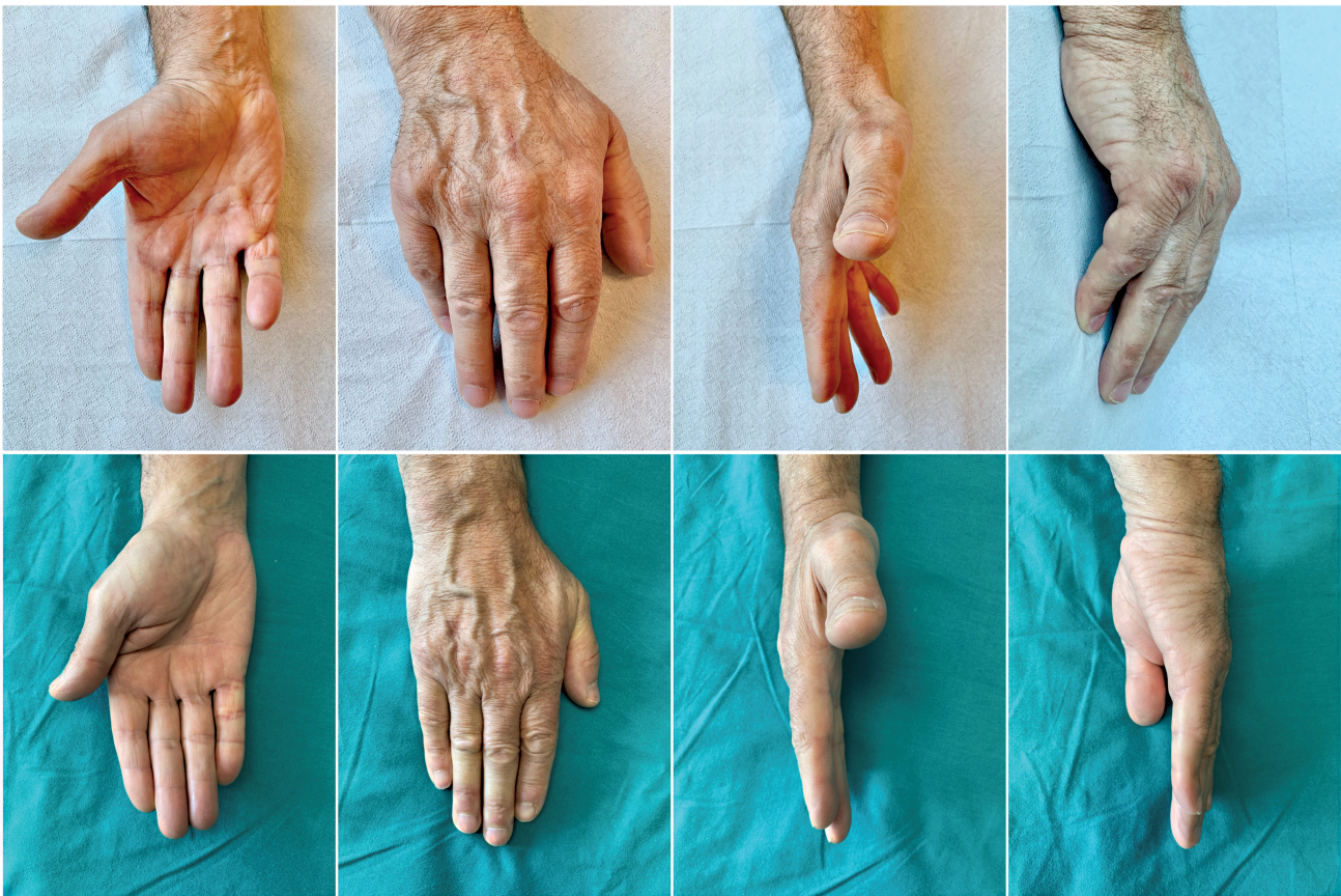
Fig. 2 Sixty-one-year-old male with recurrence of Dupuytren's contracture after injection of collagenase Clostridium histolyticum . (Above) Preoperative images showing extension deficits in the metacarpophalangeal and proximal interphalangeal joints of the IV and V fingers. (Below) Patient follow-up at 36 months.

32–75 degrees) which were corrected to an average 3.4 degrees (range: 0–12 degrees) after treatment (► Fig. 2 ).