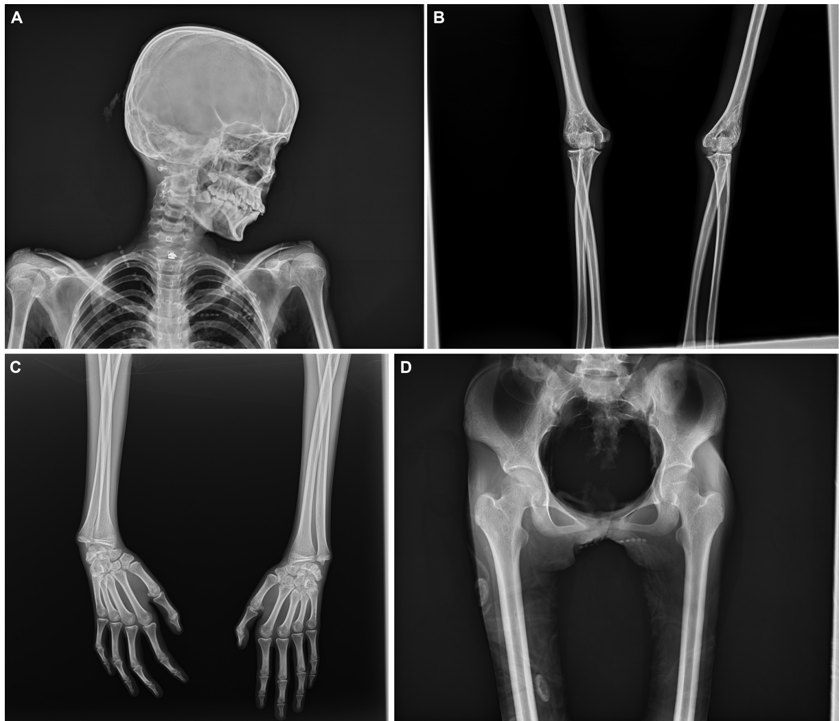
Fig. 3 (A) X-ray lateral view of skull showing: all teeth erupted except for third molar. Crown of third molar formed to the cemento-enamel junction and pulp chamber with a trapezoidal form, Acromion process appeared and not fused. Head of humerus not fused. (B) X-ray AP view of both elbow joints showing: Medial epicondyle of humerus not fused and head of radius partially fused with shaft. (C) X-ray AP view of both hands and wrist joints showing: Head of first metacarpal fused, distal end of radius and ulna partially fused. (D) X-ray AP view of pelvis and hip joints showing: Iliac crest, ischial tuberosity appeared but not fused. Head of femur not fused.

infections than women of older age. 8 Because of the immune system's natural suppression during pregnancy, women may be more vulnerable to the consequences of infection. 6 In this case the family was alleging the age of the girl to be 18 years that could be a reason to escape the legal implications. The postmortem examination revealed the age to be 15 to 16 years and this may be the best reason that the young female could not continue the advised treatment and investigations for fear of law.