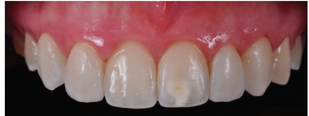
Fig. 12 Intraoral final result.

The treatment has no absolute contraindications and can be performed at any age. In the case of young patients who have not yet completed their growth (about 16 years for females and 18 for males), it is preferable to use dental veneers in composite resin. This material can be modified and/or removed more easily over time. 21