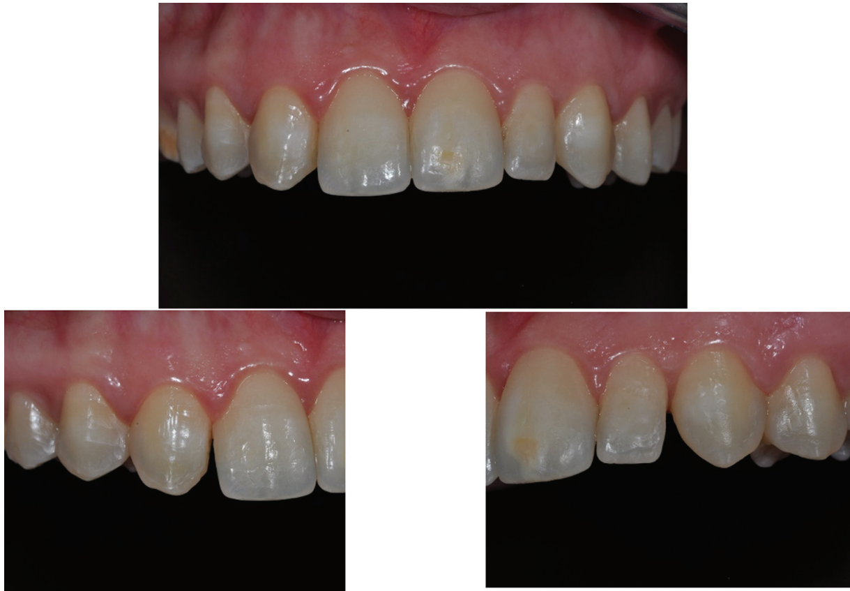
Fig. 1 Intraoral preoperative photo.