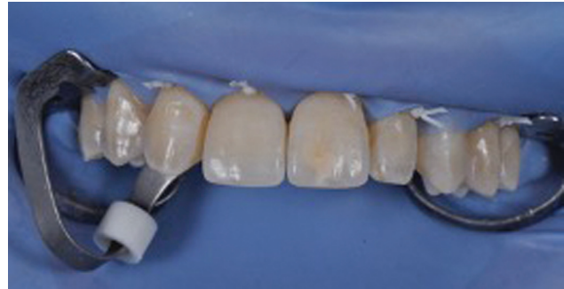
Fig. 9 Dental dam isolated field.

to create veneers, from traditional highly translucent feldspathic ceramics to the more recent highly resistant lithium disilicate-based ceramics. It is evident that a microscope or magnifying system is almost indispensable for rehabilitations carried out with these materials. The optimal mechanical properties and the high fracture resistance of the disilicate allow for the creation of definitive veneers in biomechanically nonideal situations, such as in patients with bites or the case of severe wear of the incisal edges. Since veneer preparation is a noninvasive technique that does not involve the gingival space, it is now possible to use intraoral scanners to take a digital impression of veneers. Compared to traditional ones, digital impressions do not require pastes, impression materials, or impression trays, which are often bulky and uncomfortable for patients. Intraoral scanners are high-resolution cameras that allow you to detect the shape of the teeth and gums and the color of the tissues, creating the veneers in a wholly digital way. This technique is very comfortable and quick and allows you to check the precision of the preparations in real time. 2,19,20