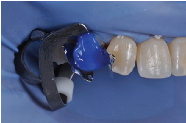
Fig. 10 Acid etching with a dental dam.