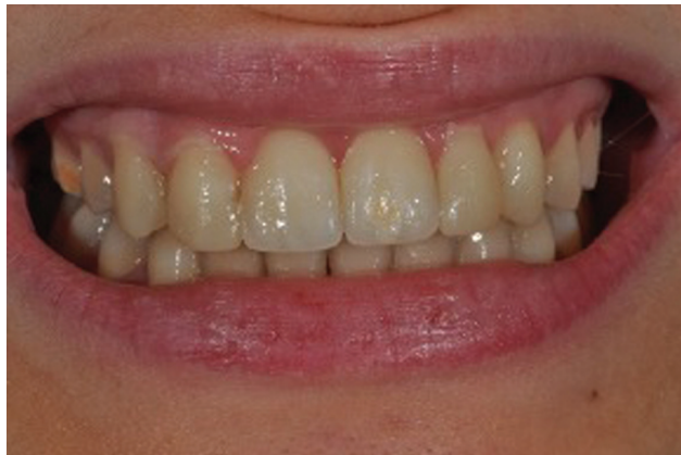
Fig. 4 Intraoral previsualization of final rehabilitation.