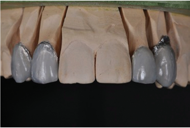
Fig. 6 Feldspathic ceramic platin-synthesized.