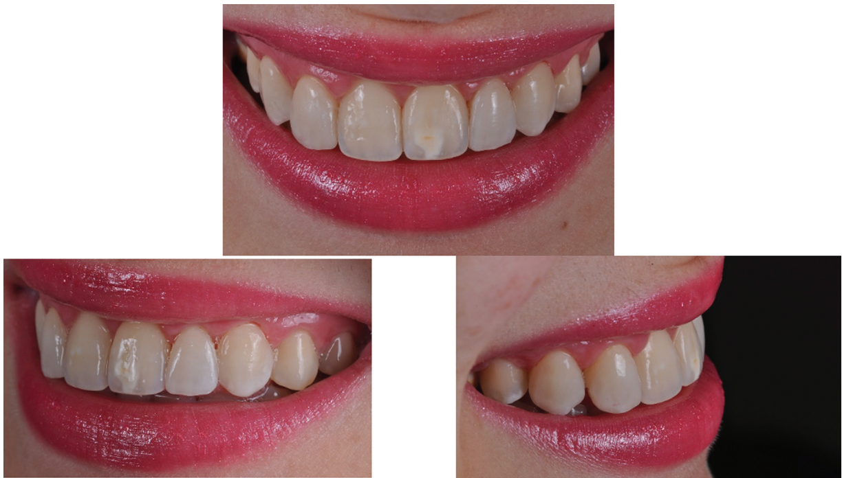
Fig. 13 Extraoral final result.

Ceramic dental veneers can be made in the presence of composite reconstructions (frequent in patients who have chipped or worn teeth), provided the filling material does not show infiltrations (dark coloring of the margins) or secondary caries. The indirect restoration in the anterior sectors still today remains the gold standard for restoring a smile respecting the canons of aesthetics, function and durability over time compared to direct composite restorations in the anterior sectors, which have the advantage of requiring a single session, lower costs, and no tooth preparation. 3,16,19,22 In fact, among the disadvantages of indirect restorations, the need to prepare the tooth to give the correct thickness to the product would not meet today's concepts of minimally inva-