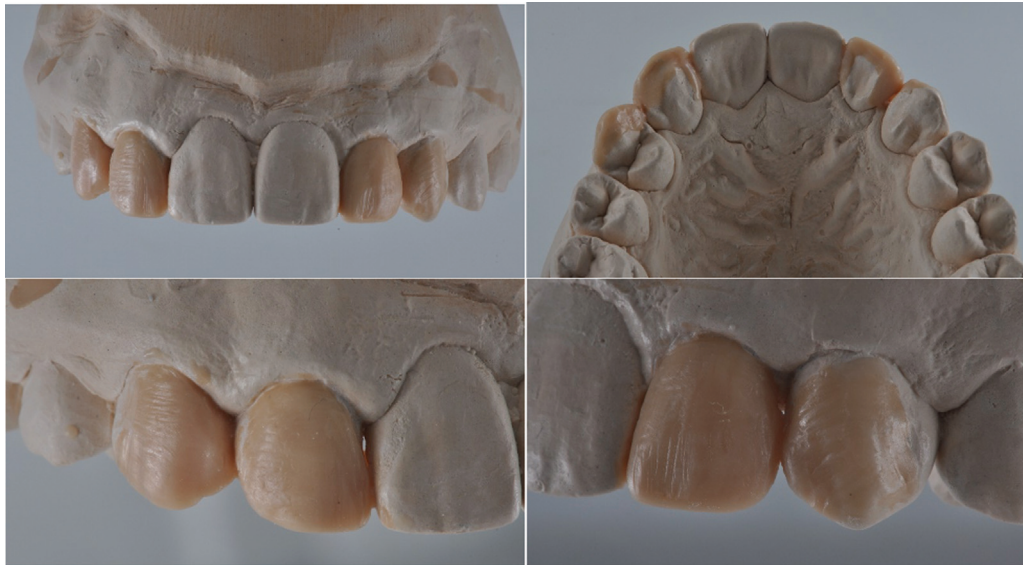
Fig. 3 Additive diagnostic wax-up.