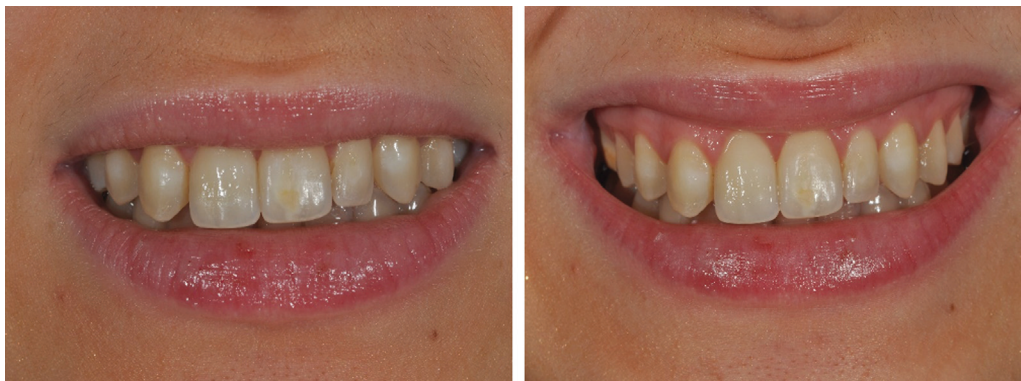
Fig. 2 Extraoral preoperative photo with relaxed and smiling lips.

hydrofluoric acid for 20 seconds to enhance the micromechanical retention of the ceramic artefacts. Crystalline precipitates are produced during acid etching, which could decrease the adhesive strength of the restorations, 12 which is removed by immersing the frameworks in an ultrasonic bath for 5 minutes. After rinsing and drying, a silane agent was applied for 1 minute. The dental substrate was etched with phosphoric acid for 60 seconds ( Fig. 10 ), rinsed and air-dried. 13 Without curing, an unfilled, hydrophobic universal bonding agent was applied to the framework and dental substrate. For the cementation of the veneers, a dual aesthetic resinous definitive cement was used, chosen based on