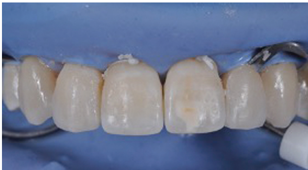
Fig. 11 Cemented veneers.