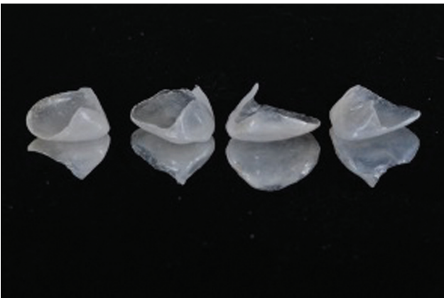
Fig. 7 Feldspathic ceramic restorations.