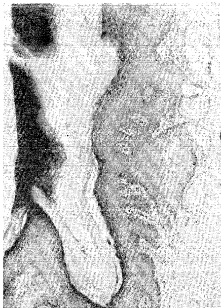
Fig. 2. Showing sinus tract lined with stratified squamous cells, sebaceous glands and sinus cavity filled with keratinized cells.

On examination there was a punctum in the mid-line of the philtrum of the upper lip overlying a small swelling. On pressing there was discharge of a thread like cheesy material from the punctum. There were no hairs coming out of it. A clinical diagnosis of dermoid sinus was made. She was operated under local anaesthesia.