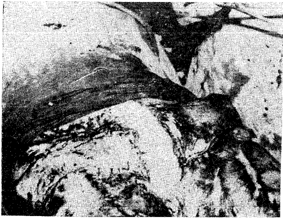
Fig. 3. Immediate post-operative view showing the flaps in position.