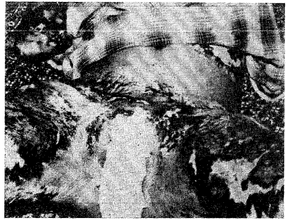
Fig. 4. Post-operative view after 3 months, showing full abduction of thighs.

of the opinion that TFL flaps with its overlying skin can be reliably raised and transposed to the nearby defects.