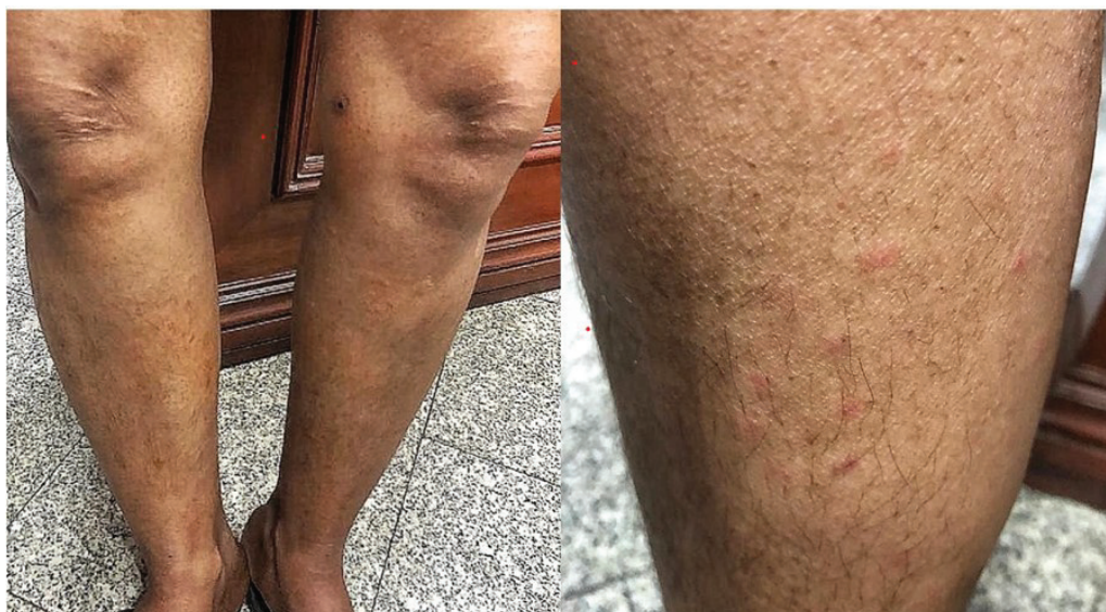
Fig. 1 Bilateral lower leg showing maculopapular rash.

Drug-induced vasculitis may be small vessel, medium vessel, large vessel, or cerebral. Small vessel vasculitis is the most common type, and may be further classified into three types, namely cutaneous leukocytoclastic vasculitis (CLCV), immunoglobulin A (IgA), and ANCA-associated vasculitis. CLCV is the most frequently seen and is associated