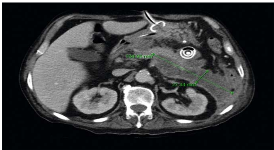
▶ Fig. 1 Computed tomography (CT) scan showing the pelvic fluid collection facing the esophageal stent placed through the gastrojejunostomy.