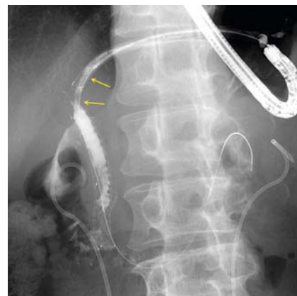
► Fig. 3 Radiographic image showing free drainage through the previously hyperplastic area (arrows) at the uncovered portion of the LPC-SEMS after wire-guided antegrade diathermic dilation.