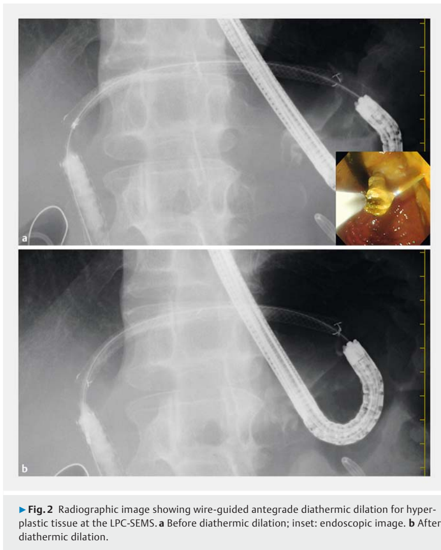
► Fig. 2 Radiographic image showing wire-guided antegrade diathermic dilation for hyperplastic tissue at the LPC-SEMS. a Before diathermic dilation; inset: endoscopic image. b After diathermic dilation.