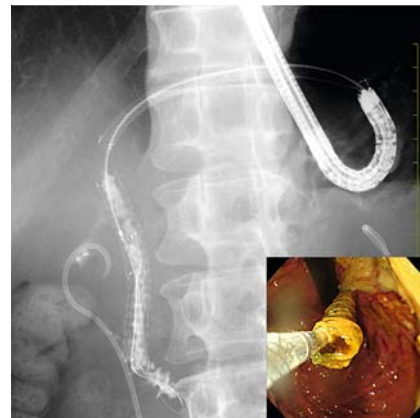
► Fig. 5 Radiographic image showing antegrade placement of ultraslim uncovered self-expandable metallic stent using the stent-in-stent method (inset: endoscopic image).