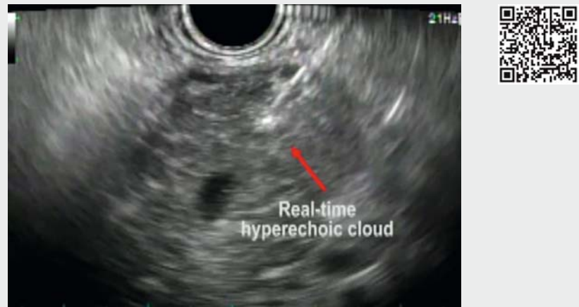
► Video 1 Endoscopic ultrasonography-guided photodynamic therapy for recurrent non-invasive intraductal papillary mucinous neoplasm (IPMN) of the pancreas following a previous distal pancreatectomy.

fore the procedure. The flexible laser-light probe (a quartz core and polymer cladding; PhotoGlow Inc., Yarmouth, Massachusetts, USA) was preloaded inside a 19G EUS fine needle aspiration (FNA) needle (Cook Endoscopy, Winston-