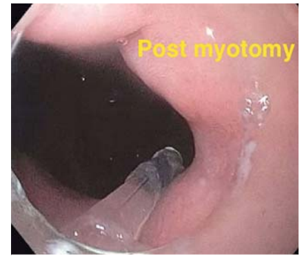
► Fig. 3 Endoscopic view of the lower esophageal sphincter after peroral endoscopic myotomy.

We elected to perform the standard POEM procedure (June 2016) along the posterior esophageal wall to avoid the submucosal fibrosis and scar from previous myotomies (► Fig. 2 ). At the end of the procedure, the adequacy of POEM was grossly assessed by smooth passage of the scope through the gastroesophageal junction (► Fig. 3 ) and intraoperative impedance planimetry (► Table 1 ). Following POEM, the patient was admitted to the hospital and remained nil per os. The following morning, cine esophagram showed no leakage. He was discharged home on a soft diet. At follow-up, his Eckardt scores was 0. HREM at 6 months revealed significant decrease in LES pressure.