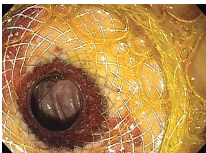
► Fig. 1 Endoscopic image of a gastrojejunal lumen-apposing metal stent.

Division of Gastroenterology and Hepatology, Weil Cornell Medical, New York, United States