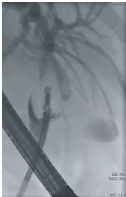
► Fig. 1 Cholangiogram showing the cholangioscope passing through the tunnel created with the electrohydraulic lithotripsy probe.