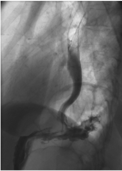
► Fig. 2 Contrast swallow study confirmed esophageal integrity after removal of the LINX device (Torax Medical, Shoreview, Minnesota, USA).