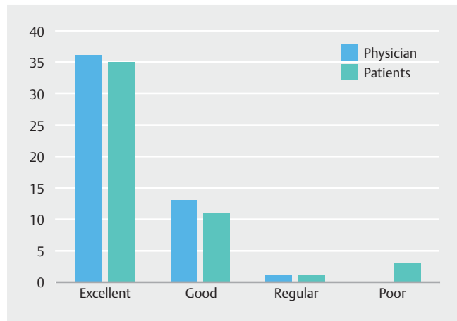
► Fig. 1 Physician and patient evaluation of tolerability of transnasal endoscopy.

► Fig. 1 shows the evaluation of TNE pain/discomfort intensity according to the examiner or the patient. Tolerance of the