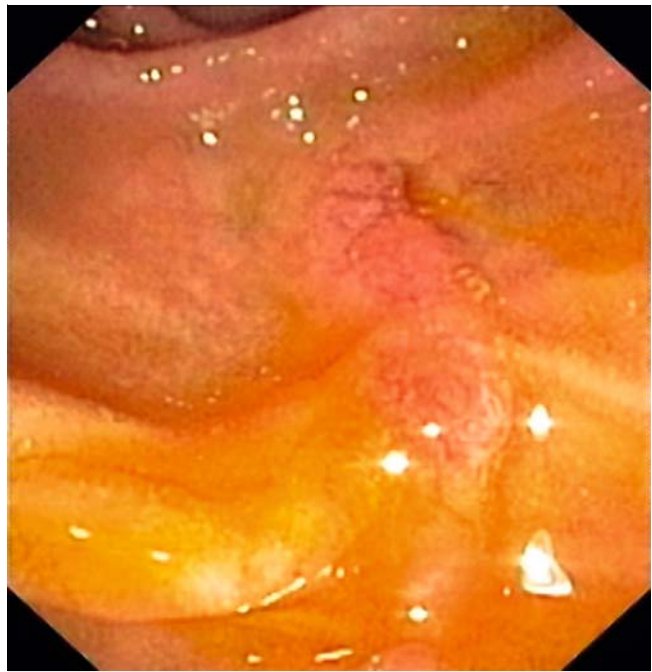
► Fig. 1 Stigma of previous sphincterotomy.

The following technique was adopted to judge the completeness of the previous sphincterotomy: after deep biliary can-