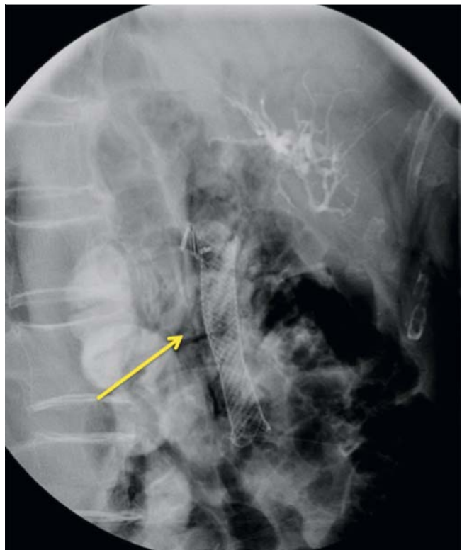
► Fig. 4 Retroperitoneal perforation with free air (arrow).