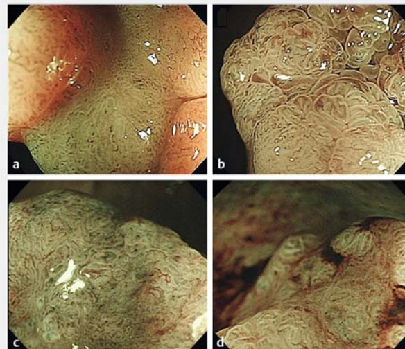
► Fig. 3 Lesions diagnosed differently between the endoscopists and the software for computer-aided diagnosis. a Lesion diagnosed as group B by the endoscopists, and diagnosed as group C by the software for computer-aided diagnosis Macroscopic Type: Is, Pathological diagnosis: Intramucosal adenocarcinoma in tubular adenoma. b Lesion diagnosed as group B by the endoscopists, and diagnosed as group C by the software for computer-aided diagnosis Macroscopic Type: Is + IIa, Depth of invasion: Intramucosal adenocarcinoma in tubulovillous adenoma. c Lesion diagnosed as group C by the endoscopists, and diagnosed as group B by the software for computer-aided diagnosis Macroscopic Type: Ip + IIc, Pathological diagnosis: Intramucosal adenocarcinoma with adenoma component. Depth of invasion: Submucosal Deep (3600 \mu m). d Lesion diagnosed as group C by the endoscopists, and diagnosed as group B by the software for computer-aided diagnosis Macroscopic Type: Is, Depth of invasion: Intramucosal adenocarcinoma in tubular adenoma.

Accurately differentiating between neoplastic and nonneoplastic lesions and estimating the invasion depth of colorectal neoplasia are essential in determining appropriate endoscopic treatment. Currently, magnifying chromoendoscopy with dye (indigo carmine/crystal violet), which has high diagnostic accuracy in differentiating colorectal lesions and in estimating the