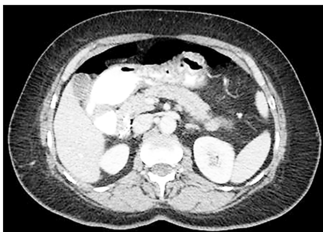
► Fig. 2 Abdominal CT scan performed 24 hours after a duodenal bulb perforation treated by OTSC placement. The clip is in the same location and the opacification with oral contrast shows no leakage.

foration without leakage. The overall clinical success rate was 81.8% (9/11). Indeed, 2 patients had to undergo surgery despite adequate closure of the perforation. The first one (Case 1) had a perforation at the rectosigmoid junction during retroflexion in the rectum. A complete seal of the perforation was obtained with a single OTSC but in the following hours, the patient had abdominal pain with localized guarding in the left lower quadrant; thus, he underwent exploratory laparoscopy, which showed no leakage after injection of methylene blue. However, there was a purulent effusion in the peritoneal cavity and a sigmoid colostomy was performed. The clinical outcome was favorable after surgery. The second patient (Case 6) also had a perforation at the rectosigmoid during diagnostic colonoscopy. The perforation was managed by placement of an OTSC and exsufflation of the pneumoperitoneum using an 18-gauge needle was performed during the procedure. A computed tomography (CT) scan 24 hours later showed a pneumoperitoneum and complete sealing of the perforation. However, the right urinary tract was dilated above the clip suggesting that the clip might have captured the right ureter. Another CT