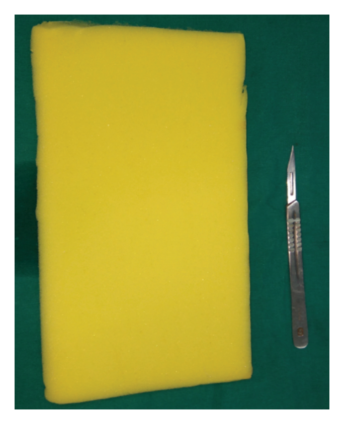
Fig. 1 Materials for our technique of hand meshing.

Skin grafting is widely used for healthy raw areas. The advantages of meshing include prevention of seroma or hematoma underneath the graft and to cover a larger surface