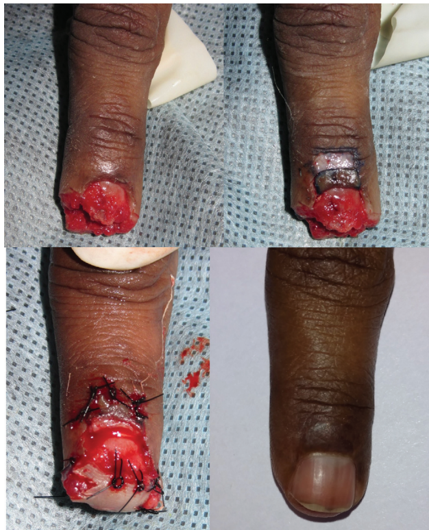
Fig. 3 Intraoperative and postoperative picture of left index finger amputation treated with eponychial flap.

toe transfer have been described to achieve a normal looking nail. 15 But toe transfer has its complications such as flap failure, donor morbidity, and aesthetic mismatch.