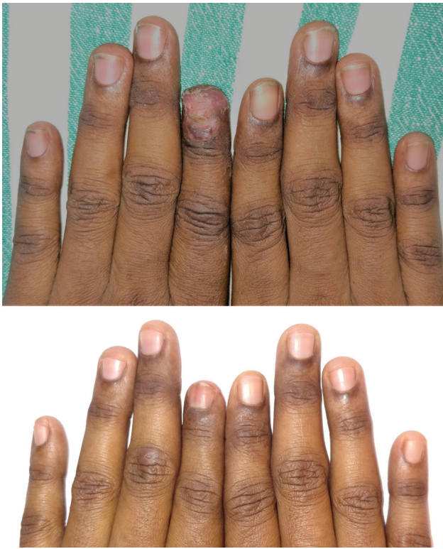
Fig. 4 Results of the same patient at 3 months postoperatively and 1 year postoperatively.

In all our cases, the eponychial flap healed without any complications, there were no flap necrosis or infection, and the resulting scar was unremarkable. There were no resulting nail deformities as hook nails. The overall outcome was excellent in 51 (65.38%) patients and good in the rest. These results are significantly better compared with the patients without eponychial flap where the excellent outcome was present only in 1 patient (1.15%) and good in 69 patients (79.31%). When offered a nail lengthening, 11 patients of group B underwent an eponychial flap.