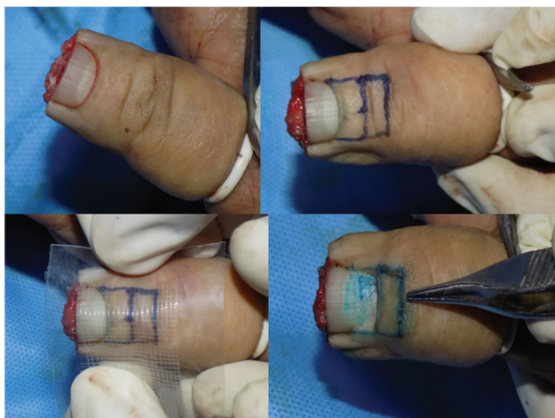
Fig. 1 Surgical steps of eponychial flap.

The required length of the nail is calculated by subtracting the present length from the total nail length of the contralateral digit. If required all of the available nail is exposed to achieve maximum length. The desired length rectangle was