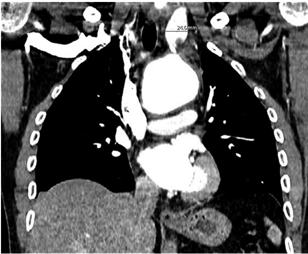
Fig. 1 Coronal view of preoperative computed tomography scan demonstrating a 55-mm aortic arch aneurysm involving the origin of the supra-aortic trunks, with a separate aneurysm of the left common carotid (25 mm).