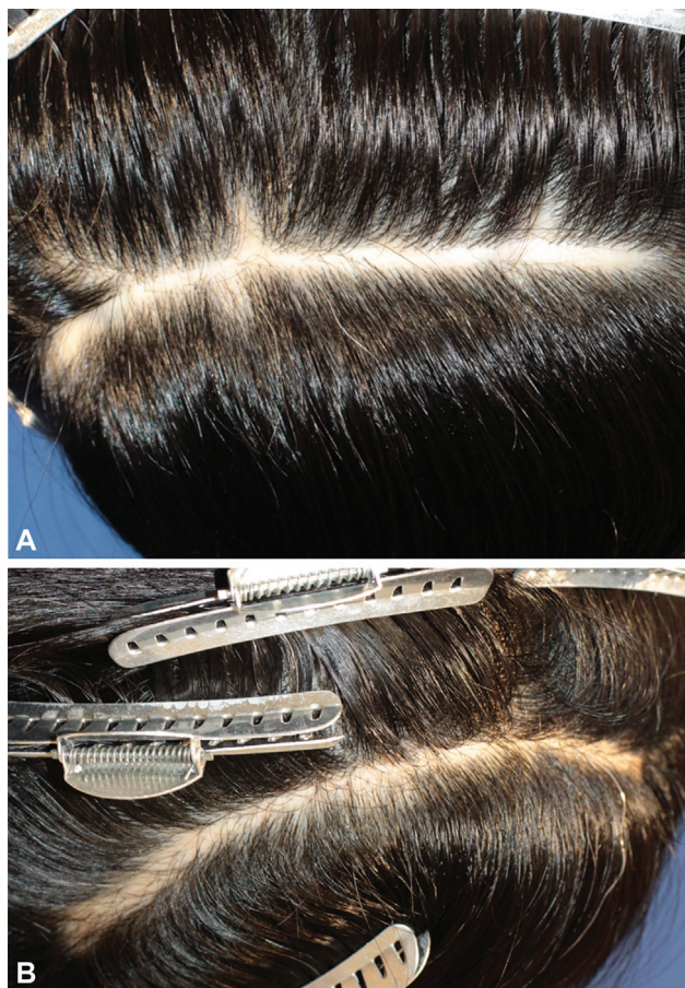
Fig. 4 (A) The example picture of patients who achieved poor result. Preoperative view. (B) One year after the operation of A. The intraoperative density was 14 \text{ cm}^2 .

FUE is useful for the treatment of scar alopecia after craniotomy. Our results suggest that the 1-year postoperative hair density should exceed 20 \text{ FU/cm}^2 to achieve good outcomes.