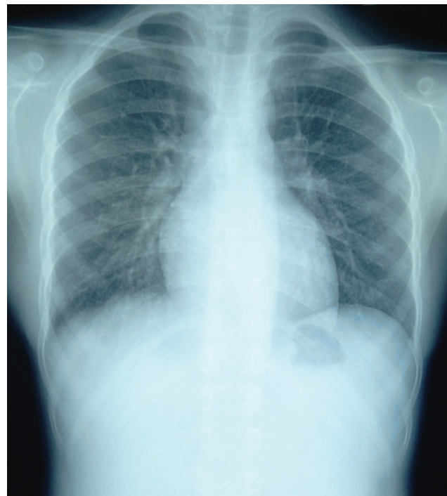
Fig. 3 Posteroanterior view of chest X-ray at sixth month follow-up period.

The definition of a modern air gun varies from country to country. In the United Kingdom, air pistols with muzzle energy of more than 8.1 J and air rifles generating energy of more than 16.2 J are termed as “specifically dangerous firearms” and require possession of a Firearm Certificate. 3,4 In contrast, those