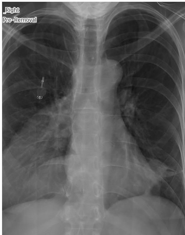
Fig. 1 Frontal chest radiograph depicts the chest wall port chamber with its catheter detached and dislodged, one end of which is seen in the SVC and the other projected over the proximal right ventricle.

inflated alongside the port catheter. This allowed for a trilobed snare to be introduced from the neck access to manipulate the proximal tip free of the thrombus and then to capture and retrieve it. Thus, the balloon minimized the risk of pushing the port catheter as well as the associated clot further into the RV/PA during the process.