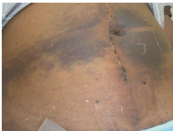
Fig. 3 Gray Turner's sign: usually seen in ruptured abdominal aortic aneurysms (AAAs), here after elective aneurysm repair.

deaths (9/44, 21%) occurred during, immediately after, or within the first week of surgery (early deaths), with postoperative myocardial infarcts comprising the majority of deaths (5/9, 56%). The survival at 2 years was 32/44 (73%) and 30/44 (68%) at 5 years, but 32/35 (91%) of patients who had surgery and survived were alive at 2 years postsurgery and 30/35