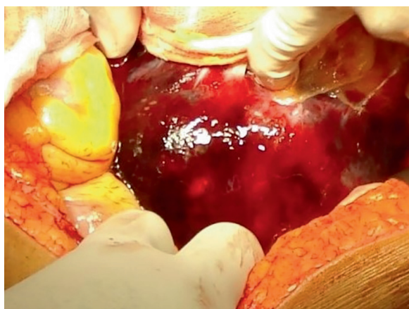
Fig. 2 Contained retroperitoneal rupture of an abdominal aortic aneurysm.