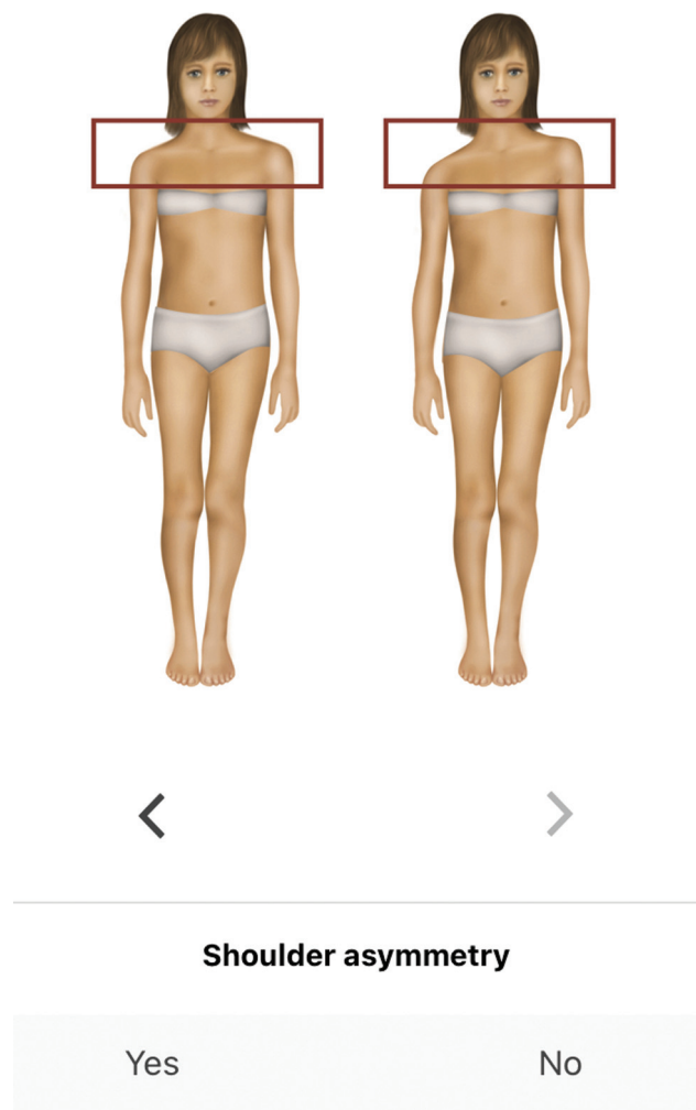
Fig. 2 Shoulder asymmetry parameter in anterior view.

in a reserved and quiet environment. The subjects who presented with positive Adam's test, shoulder asymmetry, and a reading superior to 2^\circ on the scoliometer were invited to attend a free consultation with the leading researcher. This clinical criterion was chosen to assess the use of shoulder imbalance as a parameter for further investigation. The leading researcher receives an email from the application whenever the alterations are detected and sends a letter to the guardians inviting them to the specialized medical consultation.