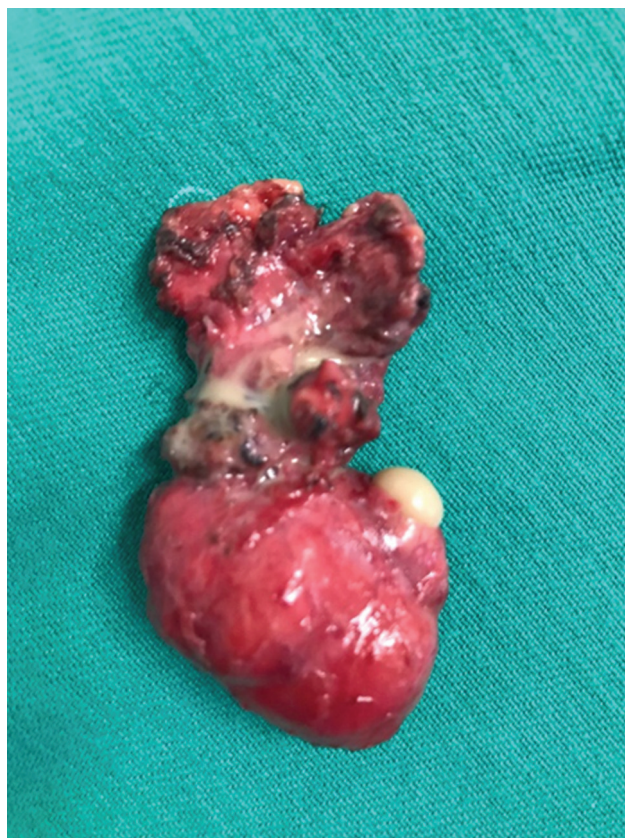
Fig. 3 Cystic lesion – incidence 2.

Although cases of tailgut cyst are mostly asymptomatic, due to contact with different structures located in the retrorectal space, their clinical manifestations can mimic those of different urological, neurological, or gastrointestinal pathologies. 3