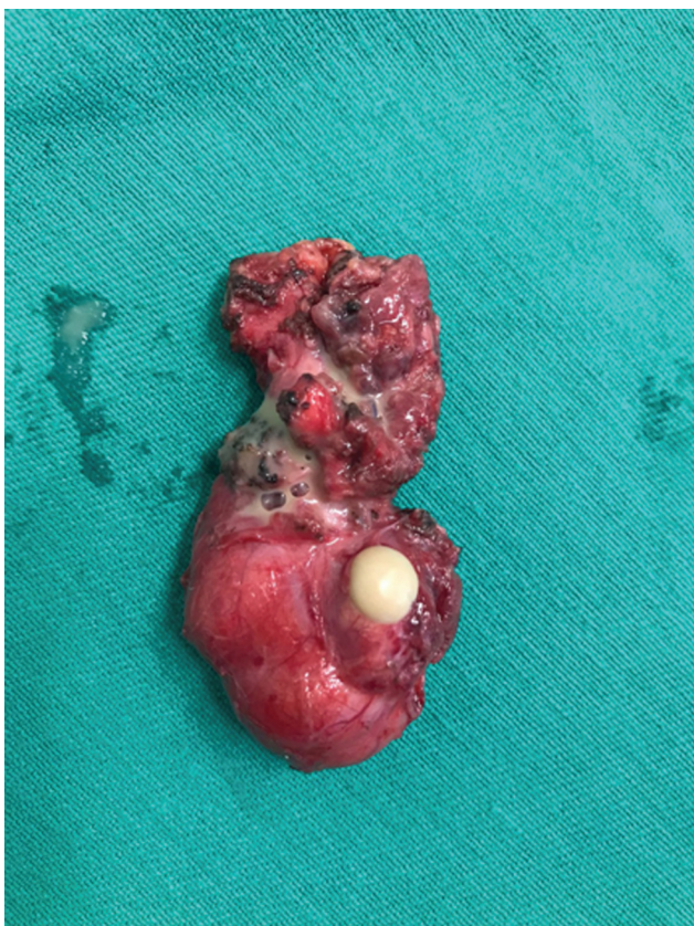
Fig. 2 Cystic lesion – incidence 1.