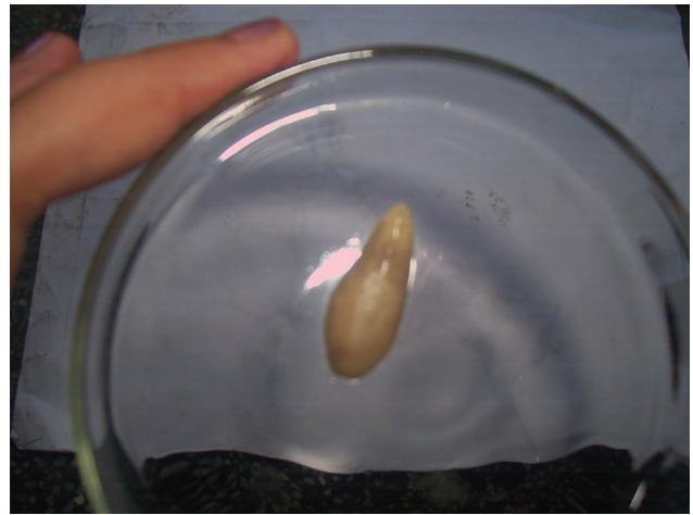
Fig. 1 Adult Fasciolopsis buski expelled with defecation.