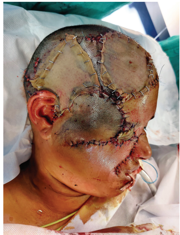
Fig. 3 Clinical photograph depicting the use of local flaps and split thickness skin grafts to provide eyeball protection in first stage.

Thereafter once the grafts healed and there was no evidence of any infection or keratopathy in the eye, the patient was again taken for the second-stage surgery after 2 weeks. In this stage the previous sutures were opened and a defect of 6 × 6 cm was created over the eyeball which was resurfaced with a free radial artery forearm fasciocutaneous flap harvested from the left forearm. Recipient vessels chosen were the right facial artery, right facial vein, and tributaries of the right external jugular vein. Along with the fasciocutaneous flap, the palmaris longus tendon was also harvested from the same forearm. The palmaris longus tendon was attached to the left-side frontalis muscle at a distance of 2.5 cm above the left eyebrow and via a mechanical pulley created using a small piece of the tendon in the right supra brow region (2.5 cm above the right eyebrow), it was directed inferiorly and sutured to the neo tarsal plate