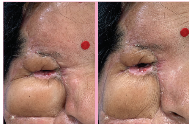
Fig. 6 Clinical photographs after revision surgery. (A) At rest with closed palpebral fissure. (B) With raised upper eyelid allowing vision.

Prior to discharge, approximately 2 weeks after the last surgery, the patient was able to lift the upper eyelid just enough to allow complete normal binocular vision with an eye opening measured around 3 mm and was very satisfied with the cosmetic outcome of the entire reconstructive process (→ Fig. 6A, B). In a 2-month follow-up, after regular physiotherapy including ultrasonic therapy and with further