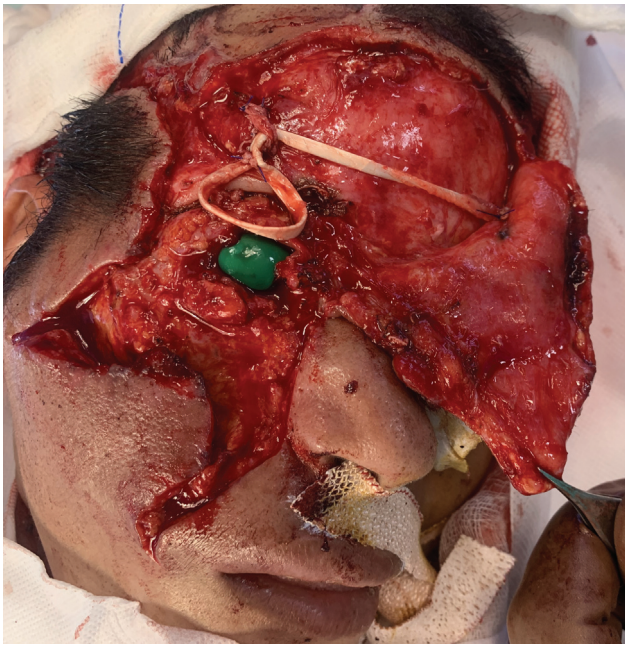
Fig. 4 Intraoperative photograph depicting the tendon-pulley system which is thereafter attached to the upper eyelid tarsal plate allowing eye opening.