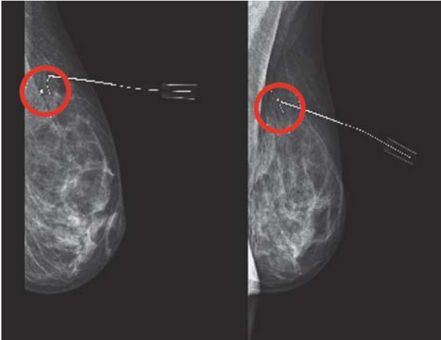
► Fig. 2 Preoperative follow-up imaging after neoadjuvant chemotherapy. Mammogram after sonographically guided wire marking of the intramammary lesion after neoadjuvant chemotherapy. The clip was located in the intramammary lesion which had decreased in size (red circle). There was no evidence of clip migration or other complications.