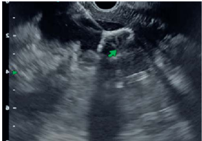
► Fig. 1 Endoscopic ultrasound image of an intracavity flange of fully covered lumen-apposing self-expandable metal stent deployed into pancreatic pseudocyst.