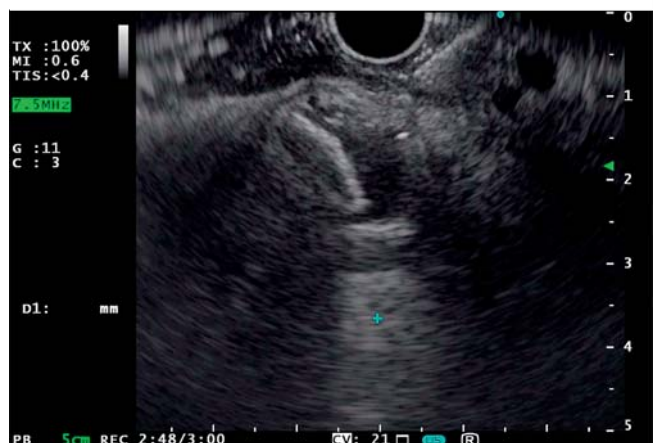
► Fig. 2 Endoscopic ultrasound image of intra-common bile duct (CBD) flange of fully covered lumen-apposing self-expandable metal stent.

assistance of endoscopic view. The scope was then gently withdrawn while the catheter control hub was slowly pushed downwards, to allow for the exit of the proximal flange (► Fig. 3 ) from the working channel to complete the release of the stent (► Video 1 ).